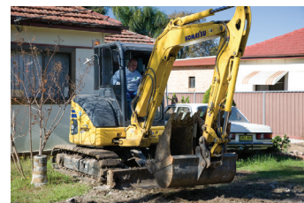
Komatsu PC50 5.5 tonne Excavator

Komatsu PC50 5.5 tonne Excavator Potain MC50B 4 tonne city crane Kubota KX61-2 Mini Excavator 753 Bobcat (part of fleet) Linde H18T Forklift