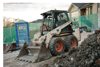
753 Bobcat (part of fleet)