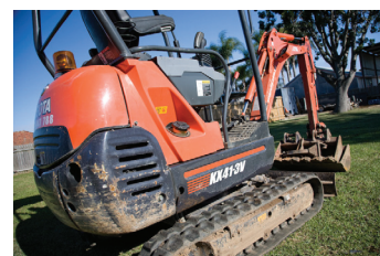
Kubota KX61-2 Mini Excavator